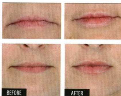
PATIENTS WHO GET LIP INJECTIONS should see natural, more youthful results. These before and after photos show the subtle differences two months after an HA filler procedure.

Downsides to collagen, however, included a 3 percent hypersensitivity reaction rate. Thus, patients had to get skin tests prior to treatment. Even so, upwards of 1 percent of people developed allergic reactions. And patients also had to return every three months for the same results—as the collagen only lasted 12 weeks.